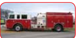
2000 Pierce Dash Pumper Detroit 350 HP Diesel Allison HD 4060P Automatic Waterous 2-Stage 1500 GPM Pump 1000 Gallon Poly Tank Hale Foam Master Foam System