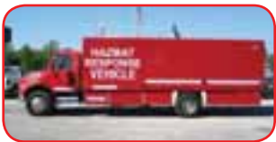
2007 FL HazMat/Command Unit Mercedes Diesel, Allison Automatic Onan 8KW Generator Light Tower with 2 - 1000W Lights Infrared and Daytime Camera Tower Work Station with Desk