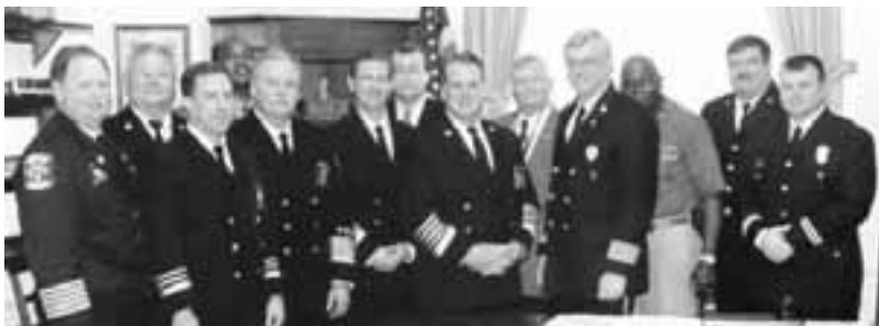
Alabama Firefighter Delegation

The nation's fire and emergency services respond to over 22 million calls annually. This event provides the opportunity to educate policy makers and the public about the vital role of fire fighters and rescue personnel, and the role of the federal government in providing funding to equip and train our first responders.