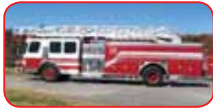
1991 E-One 75' Quint Detroit 6V92TA 400 HP Diesel Allison Automatic Hale QSMG125-23 1250 GPM Pump 500 Gallon Poly Tank Akron Foam System