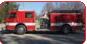
2000 Pierce Contender Pumper Detroit Series 40 300 HP Diesel Allison MD3060 Automatic Waterous CSYCX 1250 GPM Pump 1000 Gallon Poly Tank