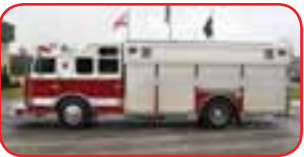
1996 Seagraves Heavy Rescue Detroit 6V92TA 400 HP Diesel Allison HT741 Automatic Winco 45KW PTO Generator Safe Air Breathing Air Compressor Four Bottle Cascade w/Refill