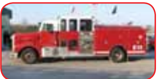
1995 Peterbuilt Rescue Pumper Detroit Series 60 430 HP Diesel Allison HT-740 Automatic Waterous CSUYBX 1500 GPM Pump 500 Gallon Poly Tank