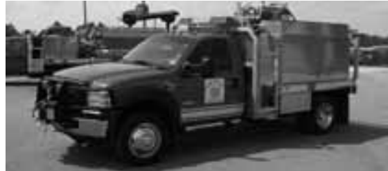
2007 F-550 Diesel 11' Flat Bed Brush Guard 375 CET Pump