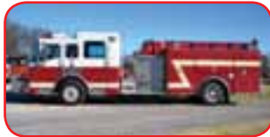
2004 ALF Custom Rescue Pumper Cummins 370 HP Diesel Allison 4000EV Automatic ALF 2000 GPM Top-Mount Pump 500 Gallon Polypropylene Tank 30 Gallon Foam Tank