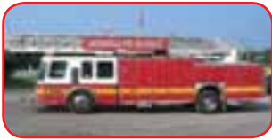
1995 E-One 110' Ladder Detroit 6V92TA Diesel Allison HT 740 Automatic Piped Waterway 8KW PTO-Driven Generator