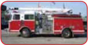
1992 KME 52' Snozzle Cummins LTA10 300 HP Diesel Allison MT-647 Automatic Hale QSG125-23 1250 GPM Pump 500 Gallon Fiberglass Tank