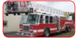
1994 Simon Duplex 95' Quint Detroit 8V92TA 475 HP Diesel Allison Automatic Transmission Waterous 2000 GPM Pump 200 Gallon Poly Tank