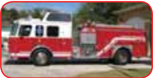
1993 E-One Rescue Pumper Caterpillar Diesel Engine Allison Automatic Transmission Hale 1250 GPM Top-Mount Pump 720 Gallon Stainless Steel Tank Inline Foam Eductor