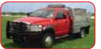
2008 Sterling 4 x 4 Brush Truck Cummins 305 HP Diesel Engine 6-Speed Automatic Transmission Gas Powered CAF System 300 Gallon Poly Water Tank 12 Gallon Foam Tank