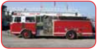
1994 KME 55' Teleboom Detroit 6V92TA 350 HP Diesel Allison HTB-741 Automatic Hale QSMG125-23 1250 GPM Pump 1250 GPM Monitor at Tip