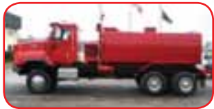
2000 International 6x6 Tanker Cummins N-14 370 HP Diesel Allison Automatic Transmission Gas Pump with Ford Engine 3000 Gallon Steel Tank