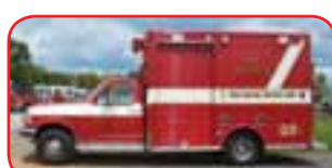
1996 Ford Service Truck Ford 7.3L Diesel Engine Allison Automatic Transmission Four-Bottle Cascade and Fill Station Honda 5KW Gas Generator