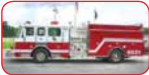
2001 ALF Custom Rescue Pumper Detroit Series 60 430 HP Diesel Allison HD4060P Automatic ALF 2000 GPM Side-Mount Pump 750 Gallon Polypropylene Tank Elkhart 125 GPM Foam System