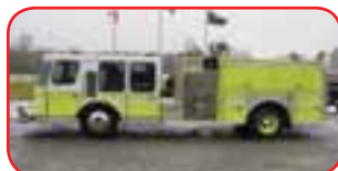
1988 E-One Hurricane Pumper Detroit 350 HP Diesel Allison Automatic Hale 1250 GPM Top Mount Pump 750 Gallon Aluminum Tank Feecon Model AP Foam System