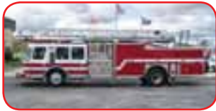
1996 E-One Hurricane 75' Quint Cummins M-11 450 HP Diesel Engine Allison Automatic Transmission Hale 1250 GPM Pump 500 Gallon Poly Tank