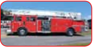
1990 Pierce Lance 75' Quint Cummins 400 HP Diesel Engine Allison HT-740 Automatic Waterous 1500 GPM Pump 300 Gallon Steel Tank