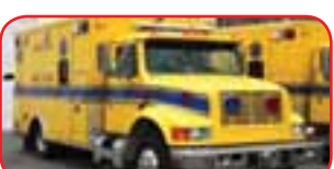
2002 International Ambulances Int'l DT466 Diesel Engine Allison Automatic Transmission Zico Cylinder Lowering Device Two Units Available!