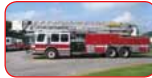
1994 E-One Hurricane 105' Quint Detroit 8V92TA Diesel Engine Allison Automatic Transmission Hale QSMG200-23 2000 GPM Pump 150 Gallon Poly Tank