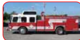
1990 E-One Hush Rescue Pumper Detroit 6V92TA Diesel Allison Automatic Hale 1500 GPM Pump w/Enclosed Panel 500 Gallon Poly Tank