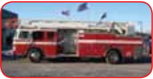
1989 Pierce Arrow 75' Quint Detroit 8V92TA Diesel Allison Automatic Transmission Waterous CSUYBX 1500 GPM Pump 300 Gallon Poly Tank