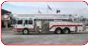
1996 Spartan/Smeal 100' Platform Detroit Series 60 470 HP Diesel Allison HD4060P Automatic Waterous CSUYBX 1500 GPM Pump 300 Gallon Poly Tank Elkhart 240-95P Foam System