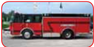
2002 Saulsbury Rescue Pumper Cummins Diesel, Allison Automatic Hale 1500 GPM Rear-Mount Pump 500 Gallon Poly Tank FoamPro Injection System