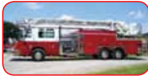
1997 Pierce Quantum 105' Quint Detroit Series 60 470 HP Diesel Allison HD 4060P Automatic Hale QSMg150-23-1500 GPM Pump 300 Gallon Poly Tank Akron 95 GPM Foam System