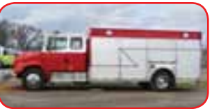
2002 FL/ALF Heavy Rescue Cummins 8.3L 315 HP Diesel Allison MD3060P Automatic Onan 25KW PTO Generator Roll-out Trays