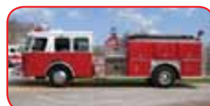
1992 E-One Protector Pumper Cummins 8.3L 300 HP Diesel Allison MD3060 Automatic Hale 1250 GPM Side-Mount Pump 1000 Gallon Poly Tank