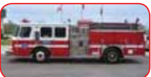
1990 E-One Cyclone Pumper Cummins LTA10 350 HP Diesel Allison MT740 Automatic Hale 1500 GPM Side-Mount Pump 500 Gallon Poly Tank