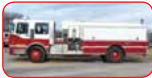
1988 Wolverine Pumper/Tanker Detroit 8V92TA Diesel Allison HT740 Automatic Hale QSMG 1500 GPM Pump 1200 Gallon Steel Tank