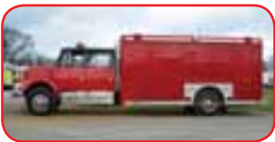
1992 Int'l/Hackney Heavy Rescue Int'l DTA466 230 HP Diesel Allison Automatic Katolight 28KW PTO Generator Ingersoll SCBA Compressor Ingersoll 4-Bottle Fill Station