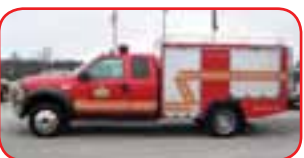
2006 Ford/Gimaex 4x4 Brush Truck Ford PowerStroke 6.4L Diesel Allison Automatic Transmission Gimaex OS-C2-110 B CAF System 250 Gallon Polypropylene Tank