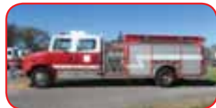
1998 FL/SC Rescue Pumper Cummins 8.3L 300 HP Diesel Allison Automatic Transmission Hale QSMG 125-23 1250 GPM Pump 500 Gallon Polypropylene Tank