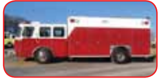
1998 E-One Heavy Rescue Cummins 8.3L 325 HP Diesel Allison MD3060P Automatic 20KW Pto Generator 12,000# Winch on Front