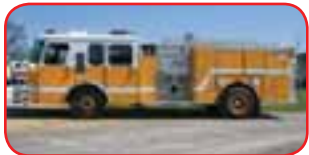
1994 E-One Rescue Pumper Detroit 6V92TA Diesel Engine Allison Automatic Transmission Hale QSMG 1500 GPM Pump 500 Gallon Poly Tank Elkhart 240-P Foam System