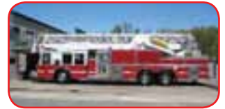
1991 Grumman 102' Platform Detroit Diesel Engine Allison Automatic Transmission Waterous CMUYBX 1250 GPM Pump 250 Gallon Poly Tank