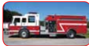
2003 ALF Custom Rescue Pumper Detroit Series 60 430 HP Diesel Allison HD4060P Automatic Hale 1500 GPM Top-Mount Pump 750 Gallon Polypropylene Tank Command Knight II Light Tower