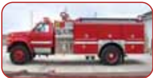
1996 Ford/E-One Pumper Diesel Engine Automatic Transmission Hale 1250 GPM Side-Mount Pump 1000 Gallon Poly Tank