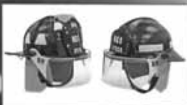
Morning Pride Helmets: 2 Models Traditional and Modern

State-of-the-art Products so Advanced that they are Covered by Multiple U.S., Canadian and International Patents and Available ONLY through MES .