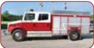
1997 Freightliner/Westex Rescue Cummins 8.3L Diesel Allison Automatic Hale AP50-20 500 GPM Pump 350 Gallon Aluminum Tank