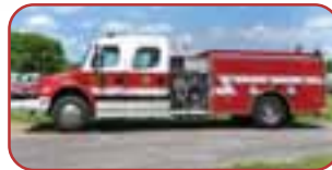
2004 Pierce/FL Pumper Cat 7.2L Diesel, Allison Automatic Waterous CSYDX 1250 GPM Pump Foam Pro 1600 Foam System 950 Gallon Poly Tank