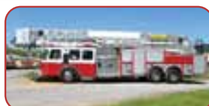
2002 E-One 105' Platform Cummins ISM 500 HP Diesel Allison HD4060P Automatic Hale 1500 GPM Side Mount Pump 150 Gallon Poly Tank Akron Dual Monitors at Tip