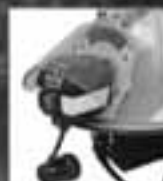
Lightest and Smallest Thermal Imaging Camera on the Market

Our fire service depth gives you unique improvements in protection and comfort, our inventory investment gives you immediate delivery and our volume purchasing power gives you unique value.