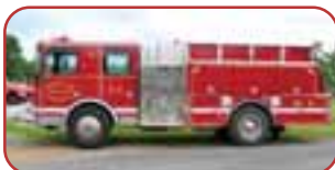
1996 HME/Four Guys Pumper Cummins 8.3L Diesel Engine Allison HD 4060 Automatic Hale QSG125 1250 GPM Pump 750 Gallon Poly Tank