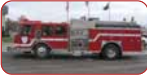
1989 E-One Rescue Pumper Detroit 8V92 445 HP Diesel Allison HT-740 Automatic Hale 1500 GPM Side-Mount Pump 500 Gallon Poly Tank