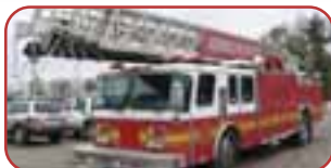
1995 E-One 110' Ladder Detroit 6V92TA Diesel Allison HT 740 Automatic Piped Waterway 8KW PTO-Driven Generator