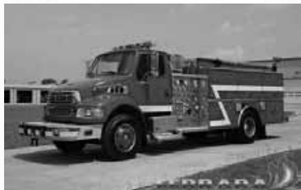
FERRARA PUMPER TANKER 1250 GPM PUMP/150 GALLON TANK