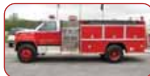
1991 GMC/American Pumper Caterpillar 3116 250 HP Diesel 5-Speed Manual Transmission Hale QSG125 1250 GPM Pump 1000 Gallon Aluminum Tank