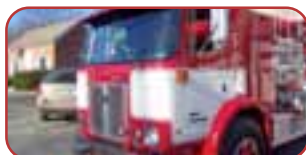
1982 Pierce Pumper/Tanker Cummins 300 HP Diesel Fuller 6-speed Manual Waterous 1500 GPM Pump 1500 Gallon Steel Tank