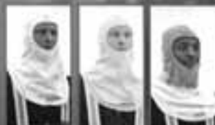
American Firewear Hoods: 4 Ventilated Heat-Guard Models 6 Standard Models