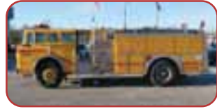
1988 Ford/E-One Pumper Caterpillar 3208 Diesel Engine Allison MT-643 Automatic Hale 1250 GPM Top-Mount Pump 1000 Gallon Poly Tank