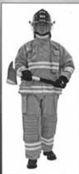
Morning Pride Clothing: 4 Models