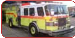
1993 E-One Rescue Pumper Detroit 450 HP Diesel Allison HT 740 Automatic Hale 2000 GPM Side-Mount Pump 750 Gallon Poly Tank Williams Foam System