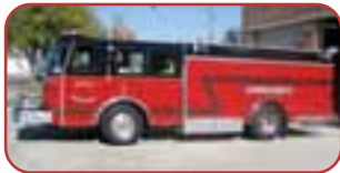
2002 Saulsbury Rescue Pumper Cummins Diesel, Allison Automatic Hale 1500 GPM Rear Mount Pump 500 Gallon Poly Tank Foam Pro Injection System