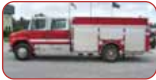
1998 Clay Fire/FL Rescue Pumper Cummins 8.3L 325 HP Diesel Allison Automatic Hale 1500 GPM Rear-Mount Pump 750 Gallon Poly Tank