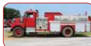
1969 White/Trautweins Pumper Cummins Diesel, CumFuller Automatic Hale 1250 GPM 2-Stage Pump Robwen Model 500 Foam System 600 Gallon Poly Tank