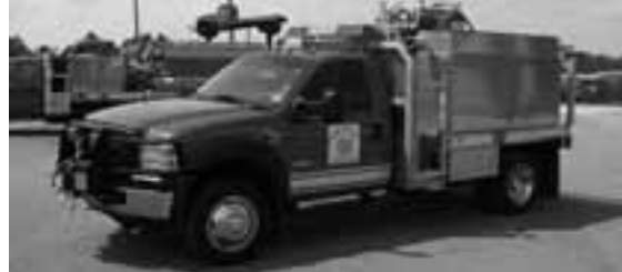
2007 F-550 Diesel 11' Flat Bed Brush Guard 375 CET Pump