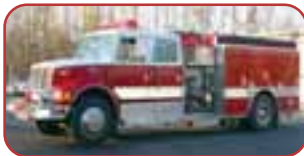
2000 Pierce/Int'l Pumper Int'l 300 HP Diesel Engine Allison Automatic Transmission Waterous 1250 GPM Pump 1000 Gallon Poly Tank