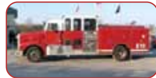
1995 Peterbuilt Rescue Pumper Detroit Series 60 430 HP Diesel Allison HT-740 Automatic Waterous CSUYBX 1500 GPM Pump 500 Gallon Poly Tank