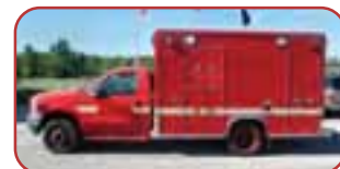
2003 Ford/Taylor Made Ambulance Ford F-450 Chassis Taylor Made Type I Ambulance Body Ford 7.3L Diesel Engine Ford Automatic Transmission