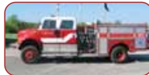
2000 Pierce 4x4 Interface Pumper Navistar DT466E 300 HP Diesel Allison MD 3060 Automatic Waterous 500 GPM Pump 500 Gallon Poly Tank