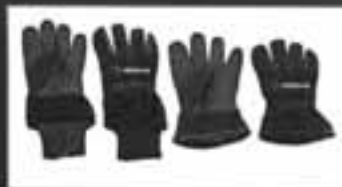
American Firewear Gloves: 2 MES Exclusive Kangaroo Models 2 Cowhide/Elk Models