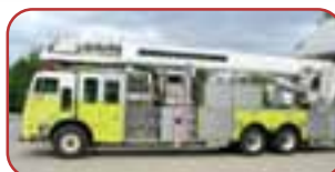
1993 Anderson/FL 135' Bronto Articulating Platform Cummins N14 410 HP Diesel Allison HT740 Automatic Hale QSMG150 1500 GPM Pump 250 Gallon Tank