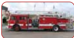
1990 Pierce Lance 75' Quint Cummins 400 HP Diesel Engine Allison HT-740 Automatic Waterous 1500 GPM Pump 300 Gallon Steel Tank