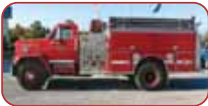
1987 E-One Commercial Pumper Detroit 6V71 Diesel Engine Allison Automatic Transmission Hale 1000 GPM Side-Mount Pump 1000 Gallon Poly Tank