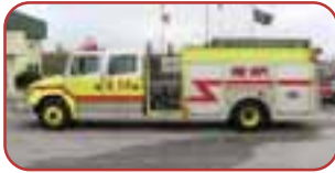
1999 SC/FL Rescue Pumper Cummins 8.3L 300 HP Diesel Allison Automatic Hale QSG125-23X 1250 GPM Pump 700 Gallon Poly Tank Akron 125 GPM Foam System