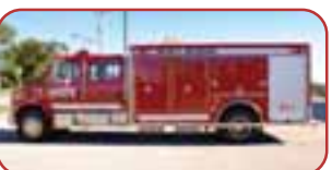
1997 FL70/3D Heavy Rescue Cummins 8.3L 300 HP Diesel Automatic Transmission 10KW Generac Diesel Generator 4-bottle Cascade w/Fill Station