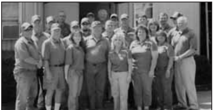
Members in Front of Harry Driggers Building