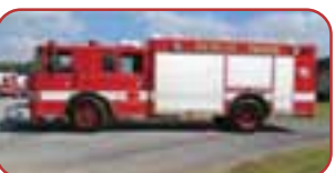
1992 Pierce Lance Heavy Rescue Cummins 350 HP Diesel Engine Allison HT740 Automatic Light Tower, PTO Generator 12,000Lb Winch