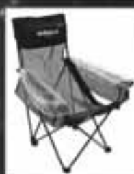
The Most Effective and Rapid On-Scene Rehab