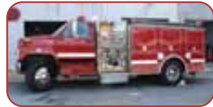
1992 GMC Pumper Diesel Engine Automatic Transmission 1000 GPM Pump 1000 Gallon Tank