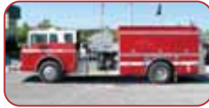
1988 Ford/Quality Pumper Cat 3208 250 HP Diesel Allison Automatic Waterous 1250 GPM Top-Mount Pump 750 Gallon Fiberglass Tank