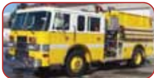
1994 Pierce Sabre Pumper Detroit 300 Horsepower Diesel Allison Automatic Waterous CS 1250 GPM Pump 750 Gallon Poly Tank