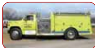
1987 GMC/FMC Pumper Detroit 8.2L Turbo Diesel Clark 557 5-Speed Manual Hale 1000 GPM Pump 1000 Gallon Steel Tank