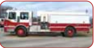
1988 Wolverine Pumper/Tanker Detroit 8V92TA Diesel Allison HT740 Automatic Hale QSMG 1500 GPM Pump 1200 Gallon Steel Tank