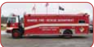
1989 Ford/Hackney Heavy Rescue/Hazmat Interior Command Center in Rear Ford Diesel, Allison Automatic Onan 7.5KW Hydraulic Generator Light Tower with 2 -1500W Lights