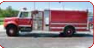
1993 Int'l/Central Pumper/Tanker Navistar Diesel, Allison Automatic Hale 1250 GPM Side-Mount Pump 1300 Gallon Poly Tank Feecon Around-the-Pump Foam System