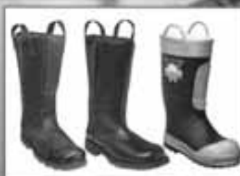
PRO-Warrington and Servus Boots: 2 Leather Models and 1 Rubber Model