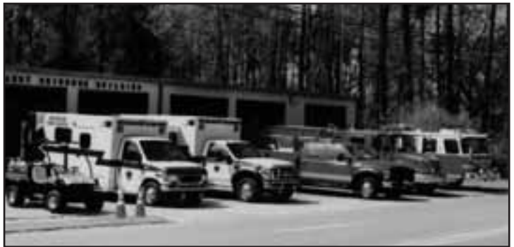
Five of Brantley's Front Line Vehicles

2008 Ford 250 Pumper 2006 Kenworth 1250 Pumper Tanker 2004 International 1250 Pumper 1991 E-One 1500 GPM Pumper 1985 E-One 250 Mini-Pumper 1996 Ford Crash Rescue Truck 2006 Ford Ambulance 2007 Ford Ambulance