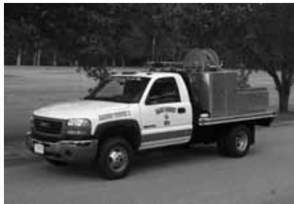
TUSCALOOSA FIRE BRUSH UNIT 2006 GMC/300 GALLON SKID UNIT