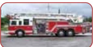
2001 Pierce Dash 105' Quint Cummins ISM 500 HP Diesel Allison HD 4060P Automatic Waterous CSU 2000 GPM Pump 500 Gallon Poly Tank