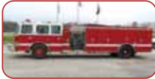
1989 Pierce Arrow Rescue Pumper Detroit 8V92TA 475 HP Diesel Allison HT740 Automatic Waterous 2-Stage 1500 GPM Pump 500 Gallon Poly Tank