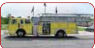
1991 Sutphen 75' Quint Detroit Diesel, Allison Automatic Hale QSMG150 1500 GPM Pump 400 Gallon Fiberglass Tank Rockwell Foam System