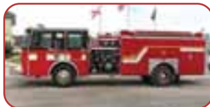
1995 Ferrara Pumper Cat 3116 300 HP Diesel Allison Automatic Hale 1250 GPM Pump 1000 Gallon Poly Tank