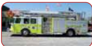
2000 E-One HP 75' Quint Cummins ISM 400 HP Diesel Allison HD 4060P Automatic Hale 1000 GPM Pump 500 Gallon Poly Tank