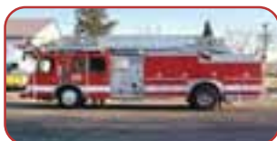
1991 E-One 75' Quint Detroit 8V92TA Diesel Allison Automatic Waterous 1500 GPM Pump 400 Gallon Poly Tank