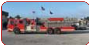
1993 Sutphen 100' Platform Cummins 410 HP Diesel Engine Allison Automatic Transmission 2 Monitors at Tip