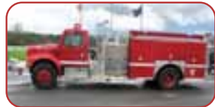
2001 E-One/Int'l Pumper Navistar DT530 300 HP Diesel Allison Automatic Waterous CSI25 1250 GPM Pump 1000 Gallon Poly Tank