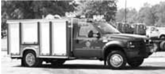
2007 F-550 Diesel 11' Rescue Body, 300 Gal Water, CAFS, Generator, Roll Up Doors

Factory & Home Office 2342 Highway 49 North Seminary, Ms 39479