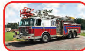
1998 E-One Cyclone 75' Aerial Call for Custom Quote Hale 1500 GPM Pump 500 Gallon Tank Detroit Diesel