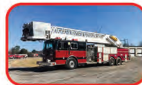
2001 Seagrave 105' Tower Call for Custom Quote Waterous 2000 GPM Pump 300 Gallon Tank Detroit Diesel