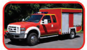
2007 Ford F-550 Quick Attack Call for Custom Quote 210 Gallon Tank 13 Gallon Foam Cell Ford Diesel