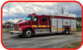
2001 Pierce Kenworth Rescue Call for Custom Quote Cummins Diesel Allison Transmission Generator