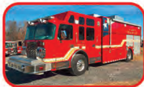
2008 Spartan SVI Heavy Wet Rescue Call for Custom Quote Hale 250 GPM Pump 250 Gallon Tank Cummins Diesel