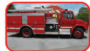
2001 Freightliner Smeal Pumper Call for Custom Quote Waterous 1250 GPM Pump 1000 Gallon Tank Cummins Diesel