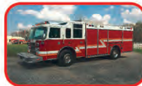
2001 Pierce Saber Rescue Call for Custom Quote Detroit Engine Allison Automatic Generator Light Tower