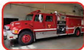
2001 E-One International Pumper Call for Custom Quote Hale 1250 GPM Pump 500 Gallon Tank Navistar Diesel