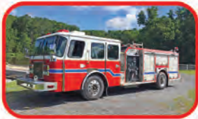
1995 E-One Pumper Call for Custom Quote Waterous 1250 GPM Pump 500 Gallon Tank Cummins Diesel