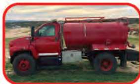
2006 GMC Tanker Call for Custom Quote 1800 Gallon Tank Caterpillar Diesel