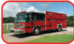
2003 Ferrara Heavy Rescue Call for Custom Quote Cummins Diesel Light Tower Cascade System