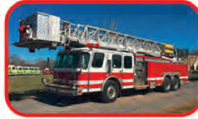
1995 E-One Hurricane 95' Platform Call for Custom Quote Hale 1500 GPM Pump 200 Gallon Tank Detroit Diesel