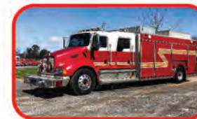
2003 Pierce Kenworth Rescue Call for Custom Quote Light Tower SCBA Fill Station