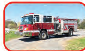
1999 Pierce Pumper Call for Custom Quote Waterous 1500 GPM Pump 800 Gallon Tank Detroit Diesel