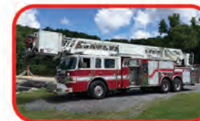
2006 Pierce 100' Platform Call for Custom Quote Waterous 1500 GPM Pump Detroit Diesel Allison Automatic