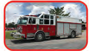
2000 KME Renegade Heavy Rescue Call for Custom Quote Detroit Diesel Generator Light Tower