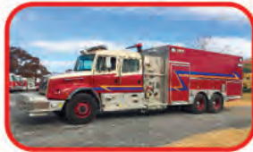
2002 Saulsbury Freightliner Rescue Pumper Tanker Call for Custom Quote Hale 2250GPM Pump 2500 Gallon Tank