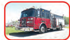
2003 Sutphen Pumper Call for Custom Quote Hale 1500 GPM Pump Tank Caterpillar Diesel