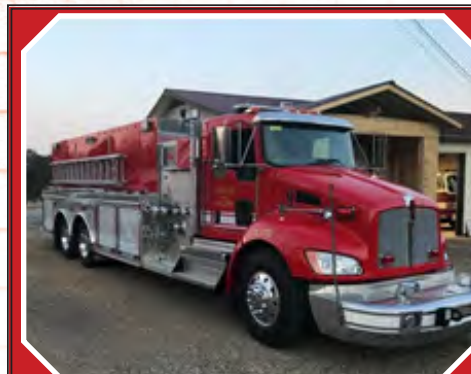
Ivallee VFD, Etowah County, recently took possession of a new 2018 pumper/tanker. The new fire apparatus was purchased with an AFG Grant.