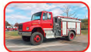
2002 Bonaventure Freightliner Quick Attack Call for Custom Quote 500 GPM Pump 600 Gallon Tank Cummins Diesel, 4x4