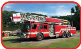
1996 E-One Hurricane 95' Platform Call for Custom Quote Hale 1500 GPM Pump 500 Gallon Tank Detroit Diesel