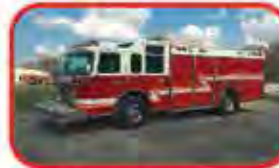
2001 Pierce Saber Rescue Detroit Engine Allison Automatic Generator Light Tower