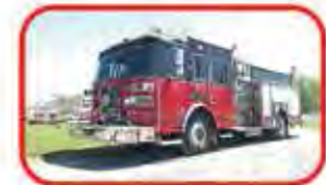
2003 Sutphen Pumper Hale 1500 GPM Pump 500 Gallon Tank Caterpillar Diesel