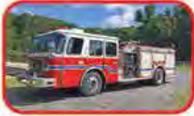
1995 E-One Pumper Waterous 1250 GPM Pump 500 Gallon Tank Cummins Diesel