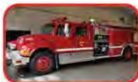
2001 E-One International Pumper Hale 1250 GPM Pump 500 Gallon Tank Navistar Diesel