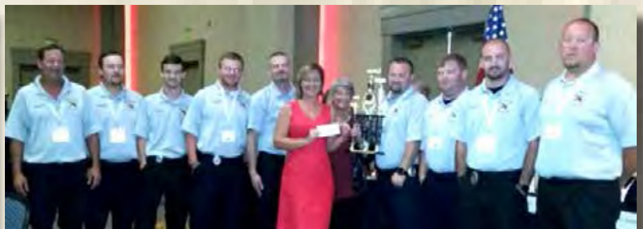
Overall 3rd Place – East Limestone VFD