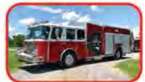
2012 E-One Cyclone Rescue Pumper Waterous 1500 GPM Pump 1000 Gallon Tank Light Tower