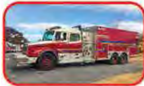
2002 Saulsbury Freightliner Rescue Pumper Tanker Hale 2250 GPM Pump 2500 Gallon Tank