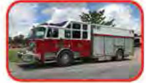
2000 KME Renegade Heavy Rescue Detroit Diesel Generator Light Tower