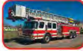
1995 E-One Hurricane 95' Platform Hale 1500 GPM Pump 200 Gallon Tank Detroit Diesel