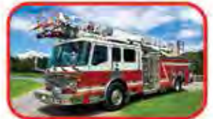
2004 American LaFrance LTI 75' Aerial Hale 2000 GPM Pump 375 Gallon Tank Detroit Diesel