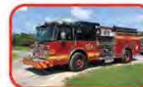
2006 Pierce Enforcer Pumper Waterous 1500 GPM Pump 500 Gallon Tank Cummins Diesel