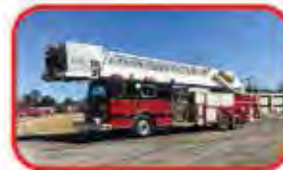
2001 Seagrave 105' Tower Waterous 2000 GPM Pump 300 Gallon Tank Detroit Diesel