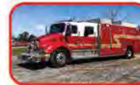
2003 Pierce Kenworth Rescue Light Tower SCBA Fill Station