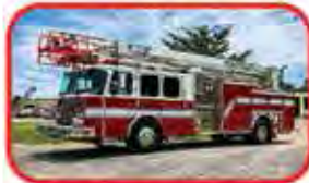
2001 E-One 75' Quint Hale 1500 GPM Pump 500 Gallon Tank Detroit Diesel