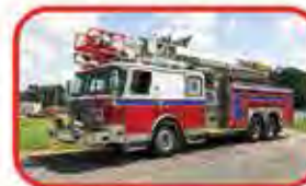
1998 E-One Cyclone 75' Aerial Hale 1500 GPM Pump 500 Gallon Tank Detroit Diesel