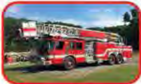
1996 E-One Hurricane 95' Platform Hale 1500 GPM Pump 500 Gallon Tank Detroit Diesel