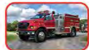
2000 E-One Ford F-750 Pumper Hale 1250 GPM Pump 750 Gallon Tank Caterpillar Diesel