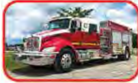
2009 Ferrara Kenworth Pumper Tanker Waterous 1250 GPM Pump 1200 Gallon Tank Foam System