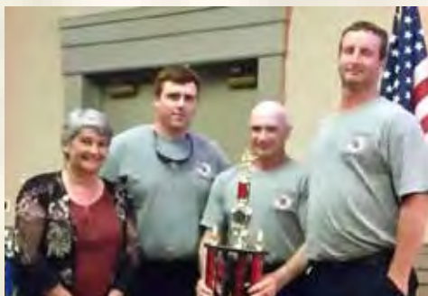
Overall 2nd Place – Fulton VFD