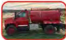
2006 GMC Tanker 1800 Gallon Tank Caterpillar Diesel Low Miles