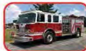
2005 Pierce Pumper Hale 1250 GPM Pump 750 Gallon Tank Cummins Diesel