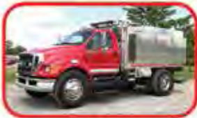
2011 Ford F-650 Quick Attack CET 210 GPM Pump 500 Gallon Tank CAFS System