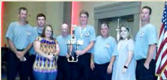
AAVFD Auxiliary Sportsmanship Award- Fulton VFD

Thomasville VFD Fulton VFD East Limestone VFD