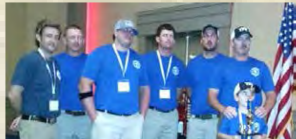
Overall Top Team Thomasville VFD