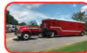
2004 Ford Tractor Trailer Haz-Mat Unit $39,000 Cummins Diesel Allison Automatic