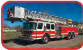
1995 E-One Hurricane 95' Platform Call for Custom Quote Hale 1500 GPM Pump 200 Gallon Tank Detroit Diesel