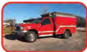
2000 General Ford F-550 4x4 Brush Truck Call for Custom Quote Waterous 120 GPM Pump 500 Gallon Tank 20 Gallon Foam