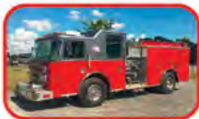
2005 Pierce Pumper Call for Custom Quote Waterous 1250 GPM Pump 1000 Gallon Tank Cummins Diesel