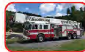
2006 Pierce 100' Platform Call for Custom Quote Waterous 1500 GPM Pump Detroit Diesel Allison Automatic