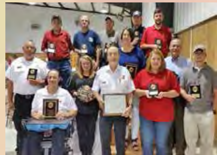
Tuscaloosa County Firefighters of the Year