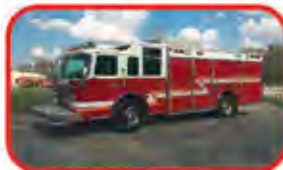
2001 Pierce Saber Rescue Call for Custom Quote Detroit Engine Allison Automatic Generator Light Tower