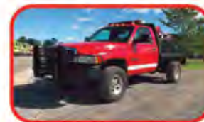
2001 Dodge Ram 4x4 Brush Truck Call for Custom Quote Hale Pump 250 Gallon Tank Cummins Diesel