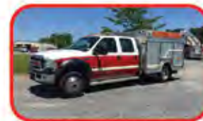
2007 Rosenbauer Ford F-550 Mini Pumper Call for Custom Quote 500 GPM Pump Poly Tank, 4x4 Caterpillar Diesel