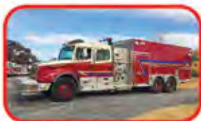
2002 Saulsbury Freightliner Rescue Pumper Tanker Call for Custom Quote Hale 2250 GPM Pump 2500 Gallon Tank