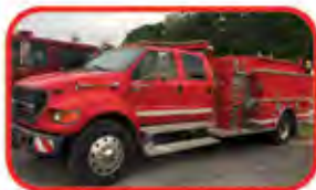
2002 Westex Ford F-650 Brush Truck $69,000 Hale 400 GPM Pump 500 Gallon Tank Caterpillar Diesel