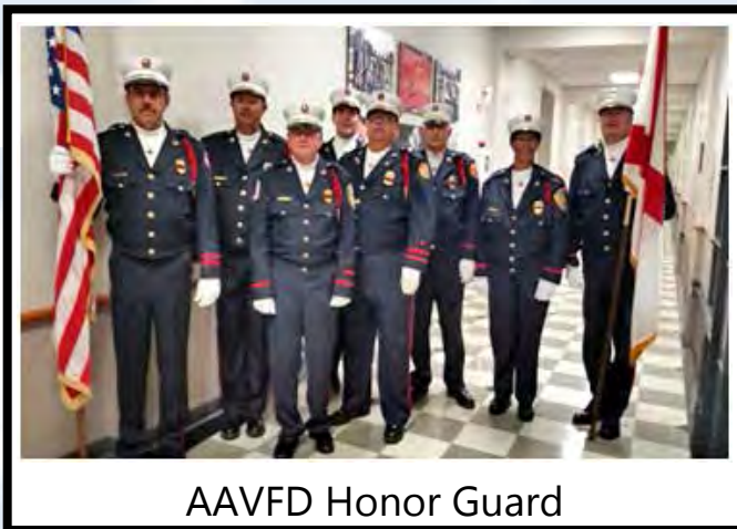
AAVFD Honor Guard

Following the ceremony, family members were taken to the Alabama Firefighter Memorial where each of the loved one's names are now added.