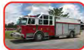
2000 KME Renegade Heavy Rescue Call for Custom Quote Detroit Diesel Generator Light Tower