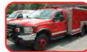
2004 Sutphen Ford 4x4 Wet Rescue Call for Custom Quote 300 Gallon Tank Powerstroke Diesel Generator