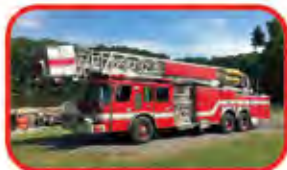
1996 E-One Hurricane 95' Platform Call for Custom Quote Hale 1500 GPM Pump 500 Gallon Tank Detroit Diesel