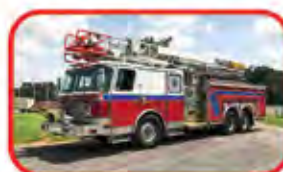
1998 E-One Cyclone 75' Aerial Call for Custom Quote Hale 1500 GPM Pump 500 Gallon Tank Detroit Diesel