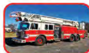
1997 Pierce Lance 105' Quint Call for Custom Quote 1500 GPM Pump 500 Gallon Tank Detroit Diesel