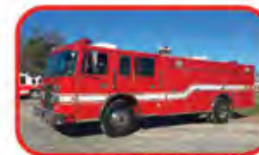
1994 Pierce Saber Rescue Call for Custom Quote Cascade System Hydraulic Reel Detroit Diesel