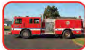
1994 Pierce Pumper $12,500 Waterous 1250 GPM Pump Poly Tank Detroit Diesel Allison Automatic