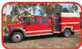
2005 Ferrara 4x4 Quick Attack Call for Custom Quote Darley Pump 300 Gallon Tank Foam Tank