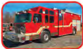
2008 Spartan SVI Heavy Wet Rescue Call for Custom Quote Hale 250 GPM Pump 250 Gallon Tank Cummins Diesel