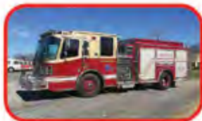
2010 Ferrara Igniter Rescue Pumper Call for Custom Quote Hale 1500 GPM Pump 750 Gallon Tank Cummins 425 HP Diesel