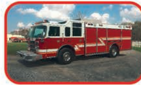
2001 Pierce Saber Rescue Call for Custom Quote Detroit Engine Allison Automatic Generator Light Tower