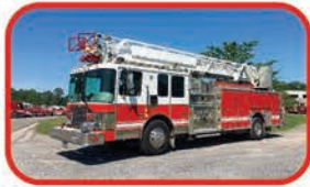
2001 HME 75' Quint Call for Custom Quote Hale 1500 GPM Pump 500 Gallon Tank Cummins Engine Allison Automatic