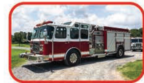
2001 E-One Rescue Pumper Call for Custom Quote Hale 1500 GPM Pump 750 Gallon Tank Detroit Diesel