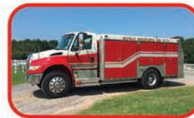
2006 International Rescue Truck $45,000 International Chassis Diesel Engine