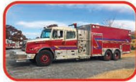
2002 Saulsbury Freightliner Rescue Pumper Tanker Call for Custom Quote Hale 2250 GPM Pump 2500 Gallon Tank