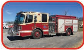
2010 Ferrara Igniter Rescue Pumper Call for Custom Quote Hale 1500 GPM Pump 750 Gallon Tank Cummins 425 HP Diesel