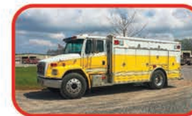
1999 International Rescue Call for Custom Quote Heated Mirrors Automatic Tire Chains Cummins Diesel Allison Automatic