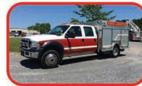
2007 Rosenbauer Ford F-550 Mini Pumper Call for Custom Quote 500 GPM Pump Poly Tank, 4x4 Caterpillar Diesel