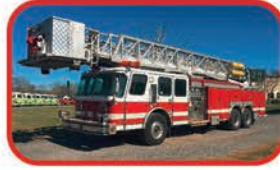
1995 E-One Hurricane 95' Platform Call for Custom Quote Hale 1500 GPM Pump 200 Gallon Tank Detroit Diesel