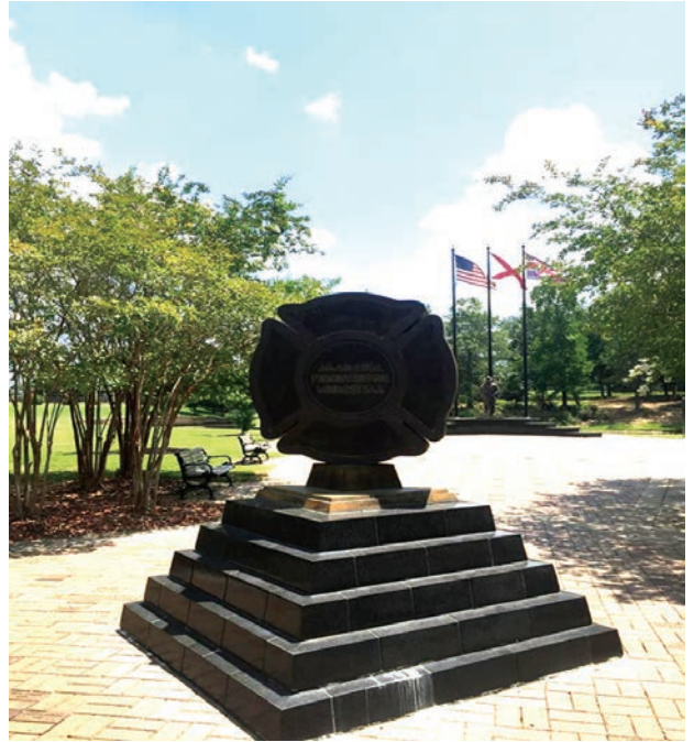
Alabama Firefighter Memorial

The Alabama Fire College is home to the Alabama Firefighter Memorial. The Alabama Joint Fire Council, made up of representatives from the Alabama Association of Fire Chiefs, the Alabama Firefighters Association, the Alabama Association of Volunteer Fire Departments and the Professional Fire Fighters Association of Alabama unanimously agreed that a monument should be erected to serve as the official memorial to honor firefighters of Alabama who have given their lives in the Line-of-Duty and to pay tribute to those firefighters who heroically serve with pride, courage and honor.