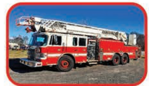
1997 Pierce Lance 105' Quint Call for Custom Quote 1500 GPM Pump 500 Gallon Tank Detroit Diesel