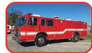
1994 Pierce Saber Rescue Call for Custom Quote Cascade System Hydraulic Reel Detroit Diesel