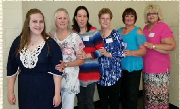
AAVFD Auxiliary Members

The AAVFD Auxiliary is an organization of volunteers formally established in August 2012 to provide services to the AAVFD and promote and encourage auxiliaries throughout the state. The auxiliary promotes friendships, creates a family atmosphere and promotes civic welfare among all departments state-wide. Our current members are from various counties throughout the state.