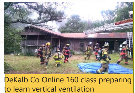
DeKalb Co Online 160 class preparing to learn vertical ventilation