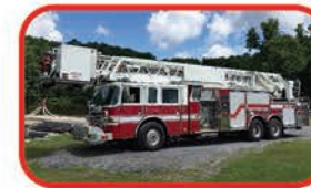
2006 Pierce 100' Platform Call for Custom Quote Waterous 1500 GPM Pump Detroit Diesel Allison Automatic