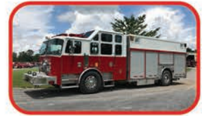
2000 KME Renegade Heavy Rescue Call for Custom Quote Detroit Diesel Generator Light Tower