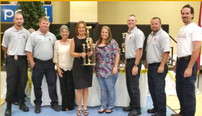
East Limestone VFD

Fulton VFD East Limestone VFD Thomasville VFD