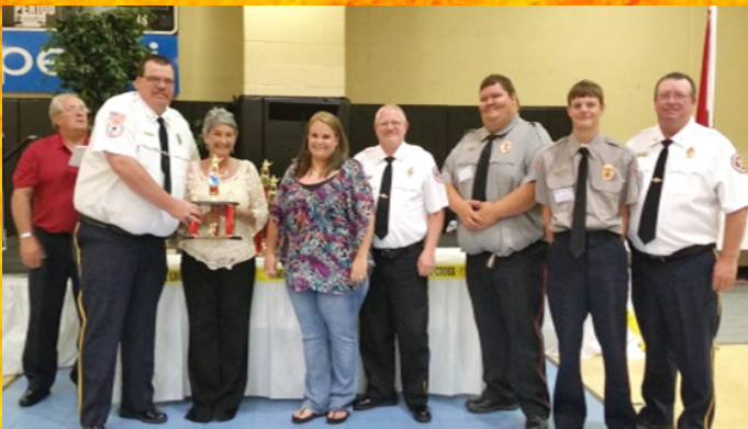
Johnson's Crossing VFD