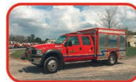
2007 Ford F-550 Quick Attack w/ CAFS Call for Custom Quote 125 GPM Pump 300 Gallon Tank, Foam 4x4