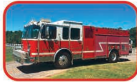
1997 Saulsbury Rescue Pumper Call for Custom Quote Hale 1250 GPM Pump 535 Gallon Tank Cummins Diesel