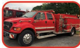
2002 Westex Ford F-650 Brush Truck $69,000 Hale 400 GPM Pump 500 Gallon Tank Caterpillar Diesel