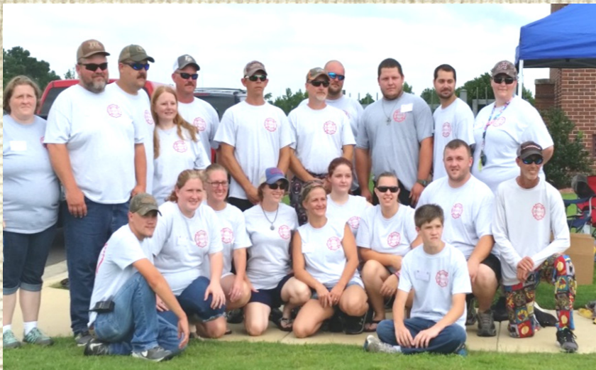
DeKalb County Association of Volunteer Fire Departments 2017 Sportsmanship Award

The auxiliary is delighted to assist with door prizes each year during the conference. During the 2017 conference, it was our honor to sponsor a Sportsmanship Award. In addition to the trophy, the team received a $100.00 donation. This award is given to the team who most exemplifies not only sportsmanship during the firefighter