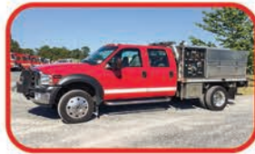
2007 Ford F-550 4x4 Brush Truck $69,000 250 GPM Pump 300 Gallon Tank 30 Gallon Foam