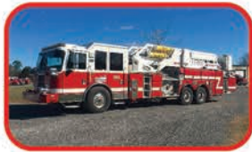
2009 KME 100' Tower Call for Custom Quote Waterous 2000 GPM Pump 300 Gallon Tank Cummins Diesel Allison Automatic