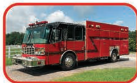
2003 Ferrara Heavy Rescue Call for Custom Quote Cummins Diesel Light Tower Cascade System