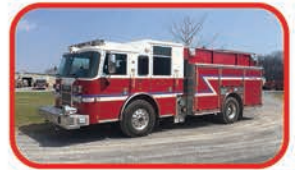
2013 Pierce Pumper Call for Custom Quote 1250 GPM Pump 750 Gallon Tank Foam System Cummins Diesel